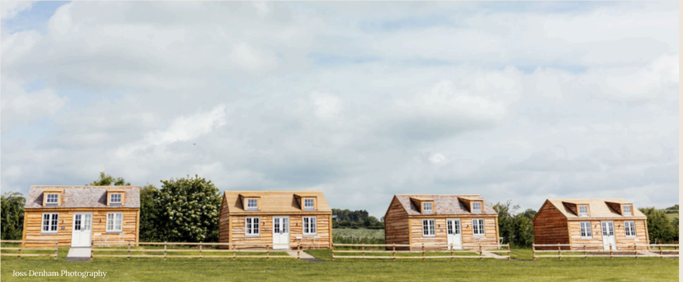
Joss Denham Photography