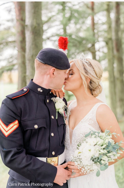
Carn Patrick Photography